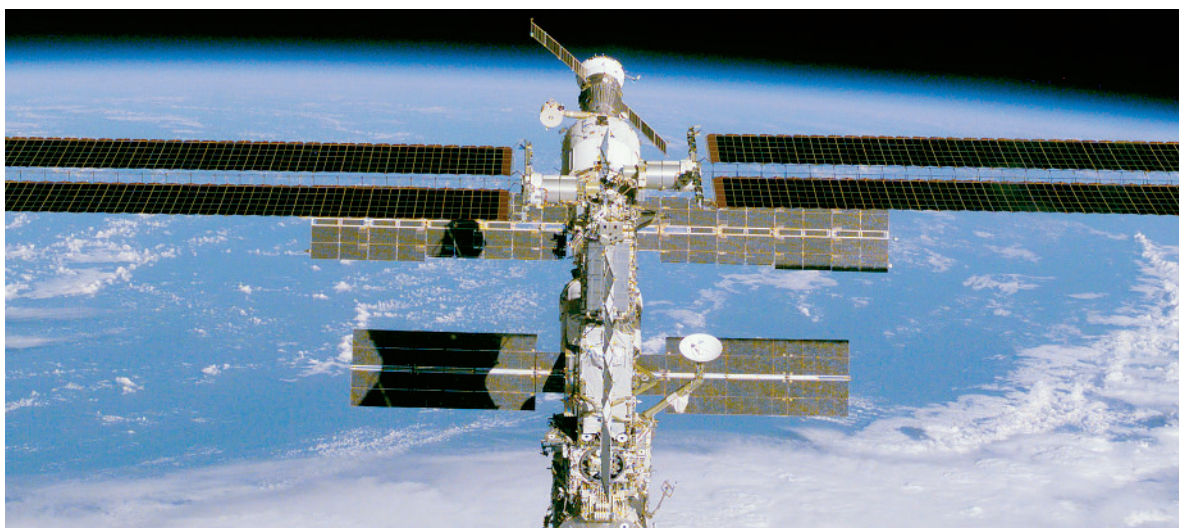
▲ This view of the ISS was taken from the space shuttle Endeavor .

of a football field and house a crew of six. Since October 2000, smaller crews have been working aboard the ISS. By early 2003, they had conducted more than 100 experiments. However, the suspension of the shuttle program after the crash of the shuttle Columbia in February 2003 put the future of the ISS in question.